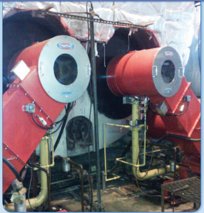
Twin Furnace Boiler

Gas Savings were quickly realised with a 11% saving recorded by Dalkia within the first year of operation.