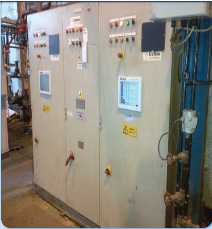
Panel Retrofitted With Mk7 Controllers